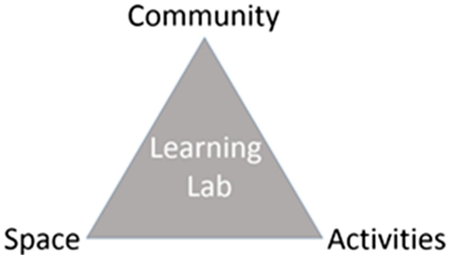
Fig. 2 The learning lab as a 3-dimensions model

The 3 dimensions are not isolated. They interact so that each dimension is impacted by the choice made for the design and implementation of the two others dimensions. This leads to the fact that each decision taken in terms of design and implementation should be based on a systemic approach.